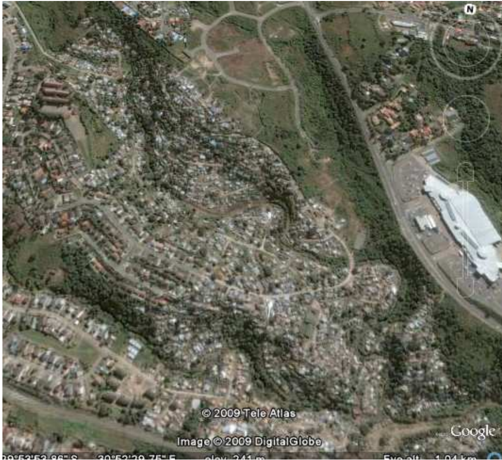
Figure 1: Chatsworth/Bottlebrush shack settlement