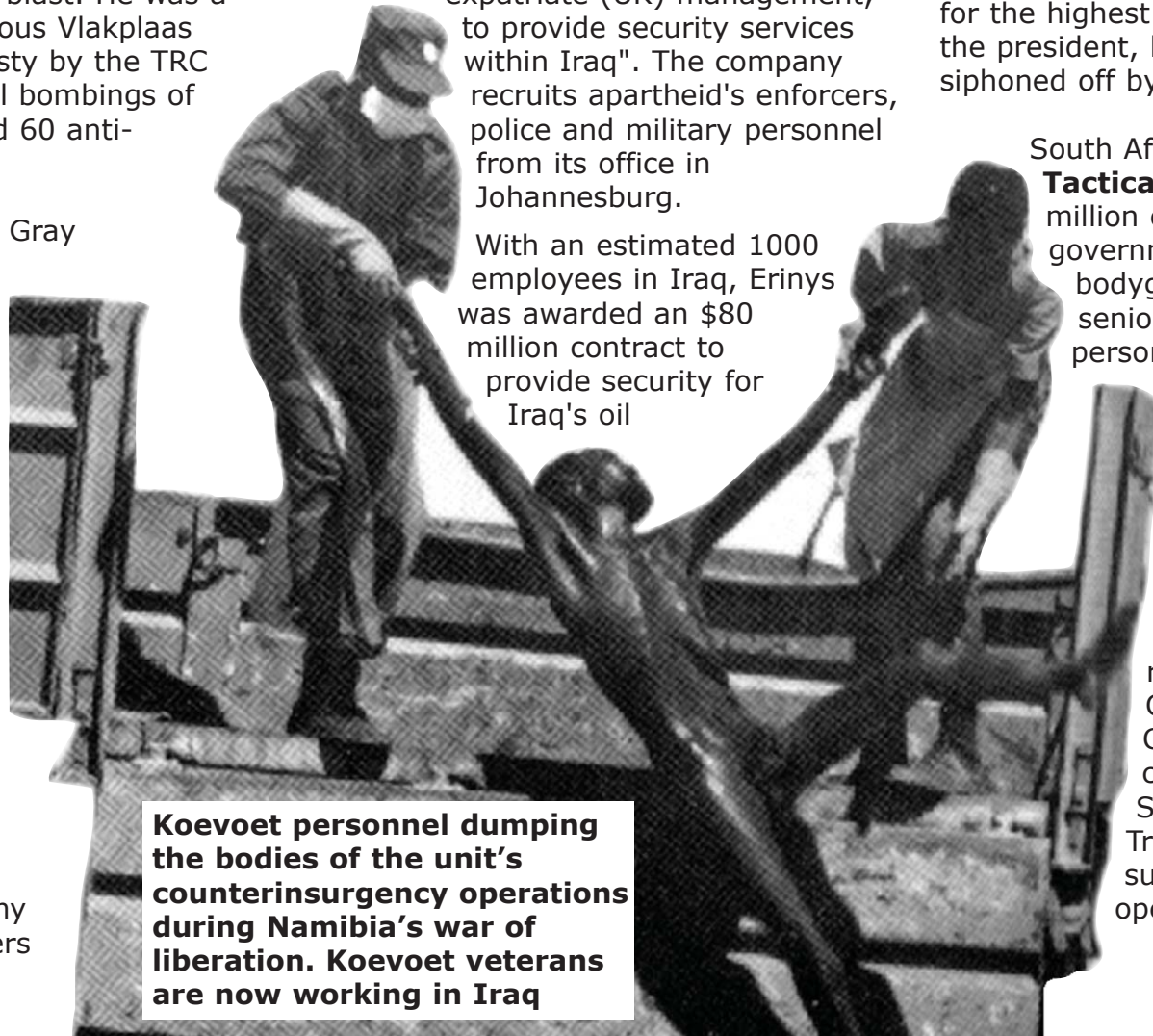
Koevoet personnel dumping the bodies of the unit's counterinsurgency operations during Namibia's war of liberation. Koevoet veterans are now working in Iraq

Foreign Military Assistance Act outlaws the recruitment of mercenaries in SA. According to the act, all security companies working outside the country must register with the National Conventional Arms Control Committee (NCACC). Just two companies, Meteoric Tactical Solutions and Grand Lake Trading 46 (Pty) Ltd, have submitted applications to operate in Iraq.